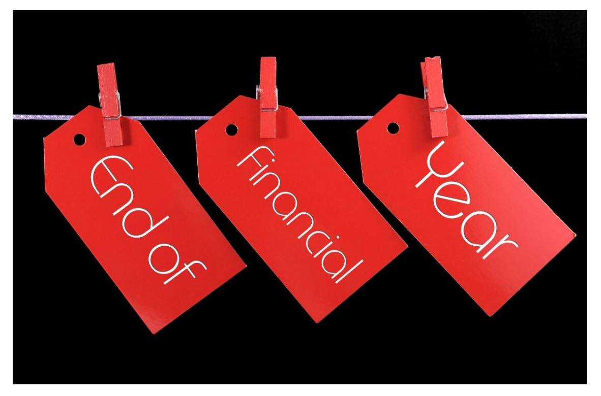
Make the Most of your End of Financial Year Tax Advantages!

It is that time of the year where supplier and dealers provide offers and incentives to buy their equipment and there are many reasons why this year maybe a good year to take advantage of these EOFY offers.