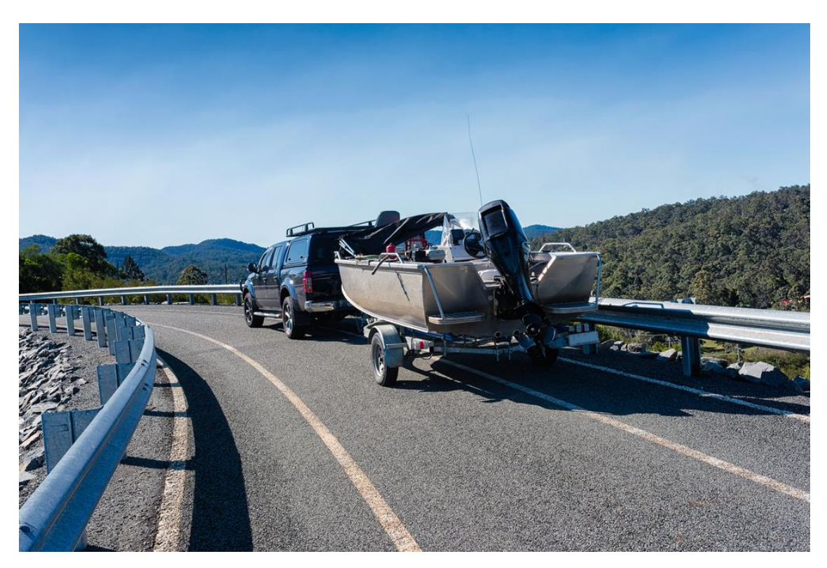
Release your adventurous spirit!

Benefits gained from buying new or used assets – Generally new assets will increase business efficiency and reduce maintenance costs. Including the added advantage of a potential reduction in the amount of tax payable as a result.